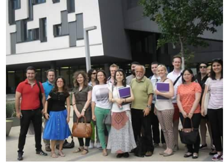
2015 Summer School, Vienna

Given the high interest raised by this event, ERSA summer schools will definitively continue to be a 'must-be' event for future young regional scientists